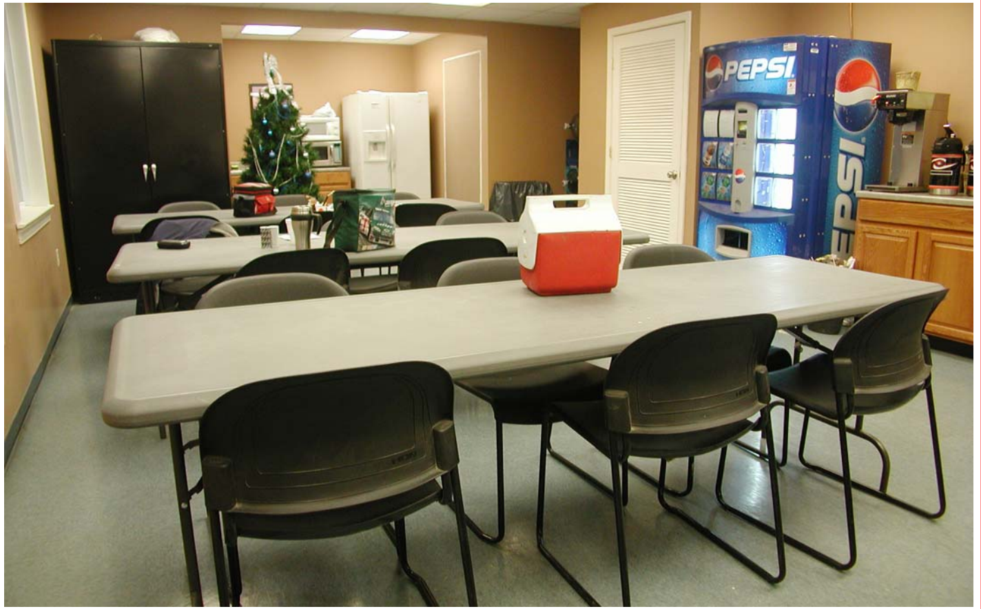
LOWER LEVEL BREAK ROOM