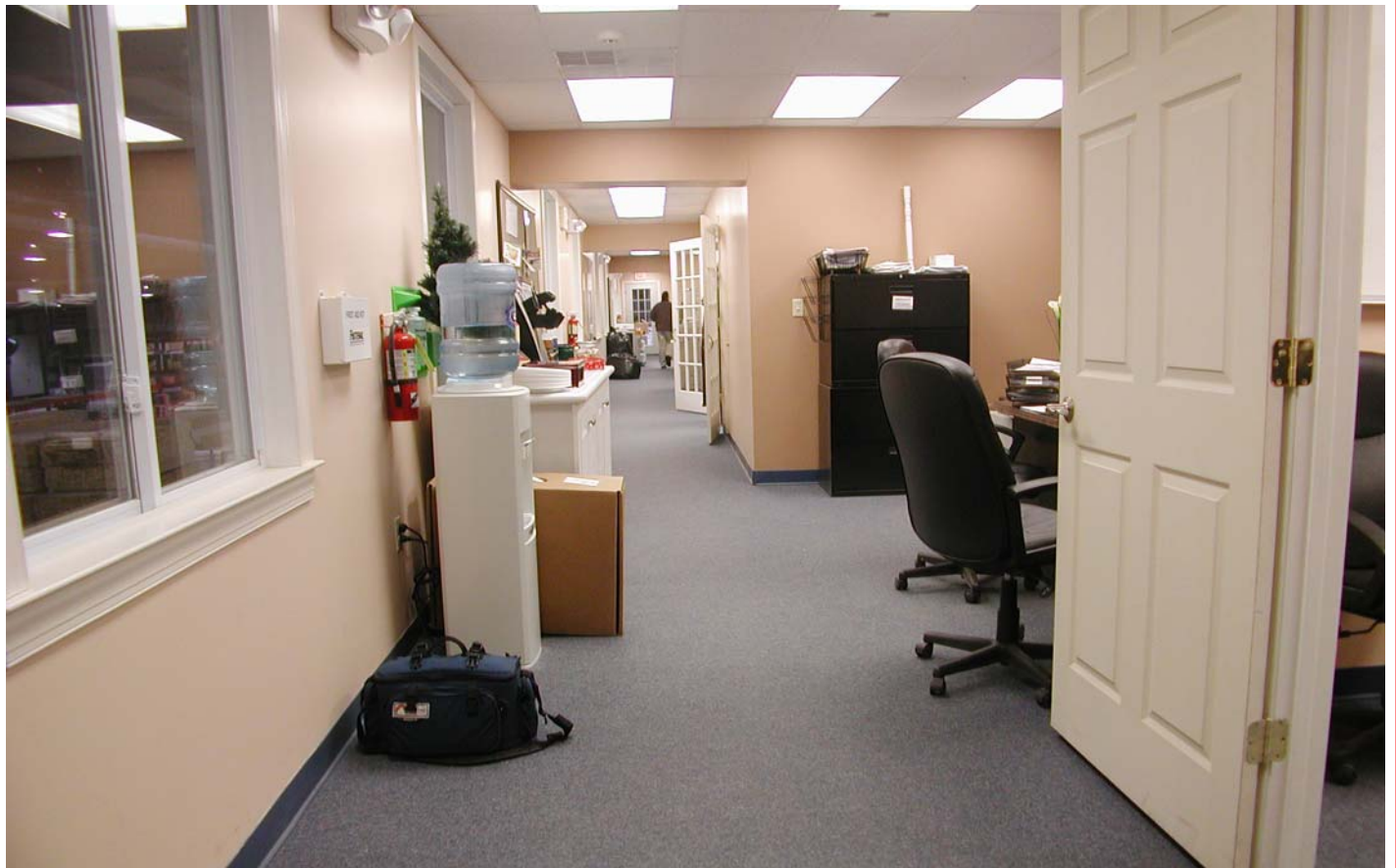
UPPER LEVEL OFFICE SPACE