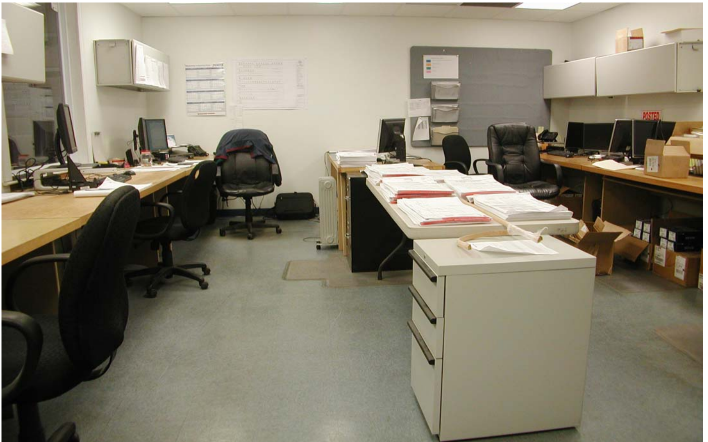
LOWER LEVEL OFFICE SPACE