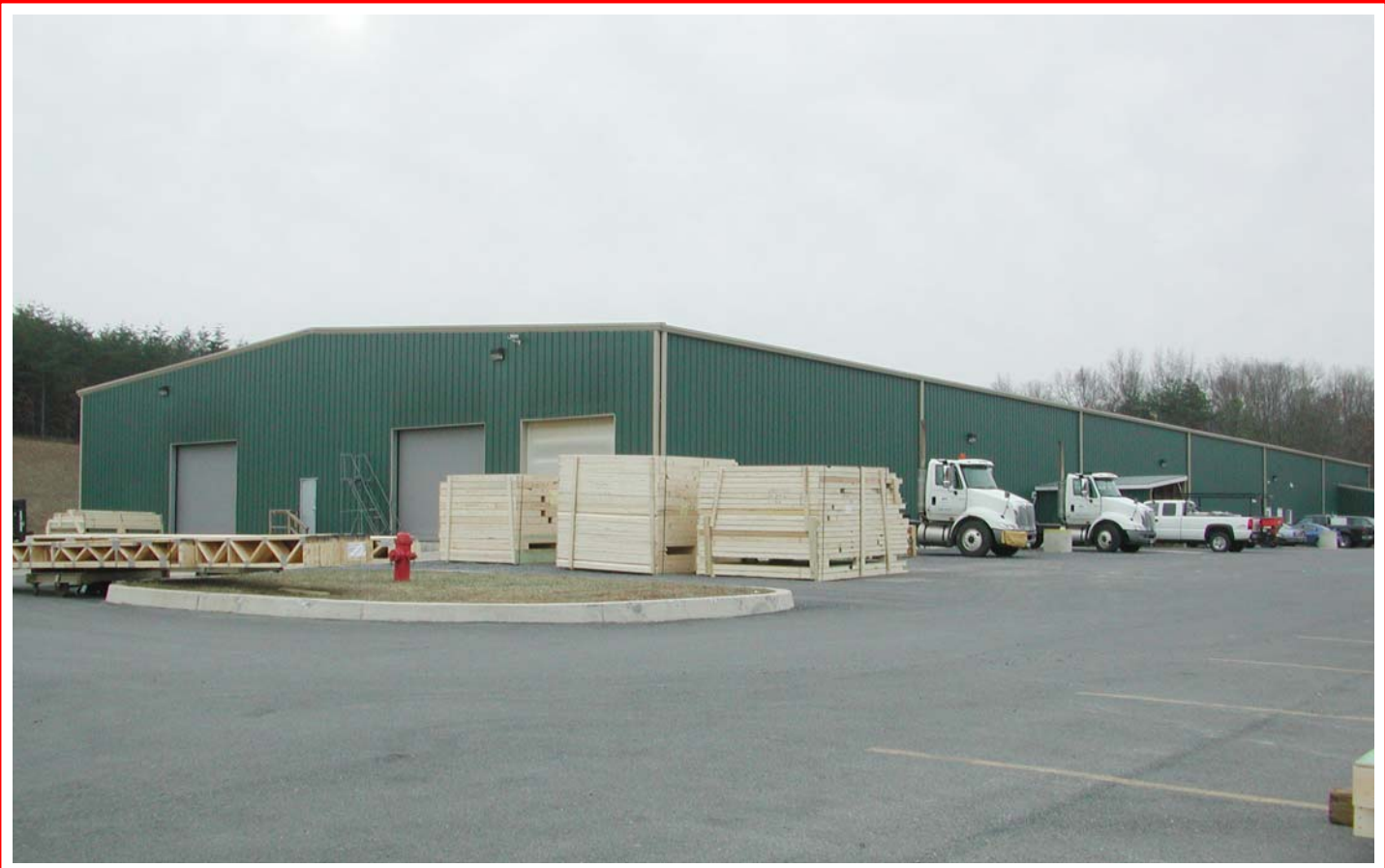
FRONT AND SIDE VIEW OF BUILDING